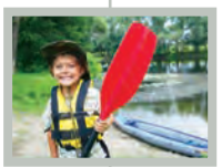
Camp Gan Israel established