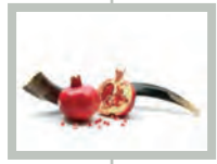
First Community High Holiday Services