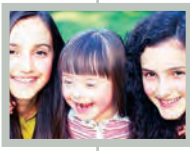
Spa for the Soul; Sunday School for Special Needs Children established