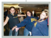
Bat Mitzvah Club established