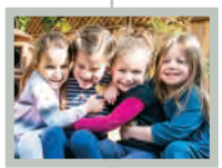
Chai Preschool founded with 8 students